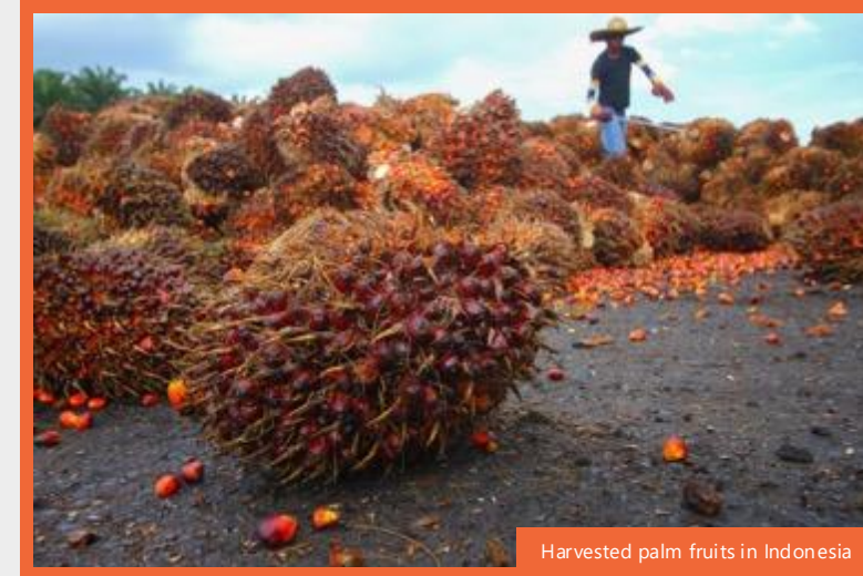
Harvested palm fruits in Indonesia

During 2024, the project continued operating under Phase 3, which started in 2023. Please review the KPIs of the project in the next page.